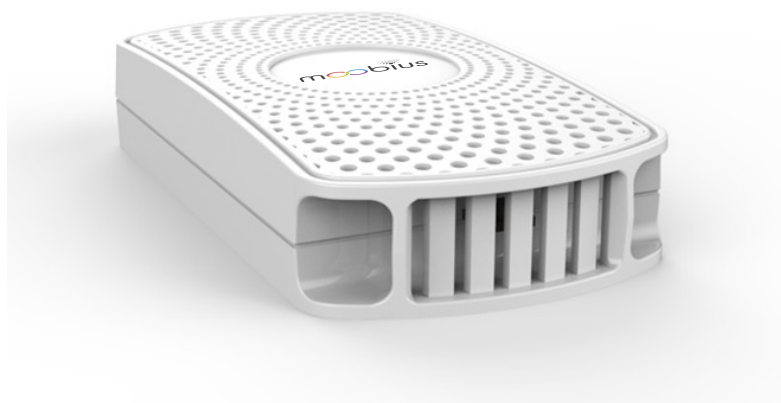
BT 5.0 Temperature and Humidity Sensor Beacon S1